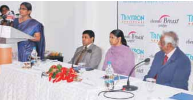
Ms. Kanimozhi, Member of Parliament, inaugurating the centre

Going digital means the procedure is quick and easy, involves lesser discomfort to the patient, ensures low dose of radiation & better accuracy, particularly in the 40 to 50 yrs age group. All images are archived and stored digitally and hence loss or damage of films will not affect patient care during follow up. Since the data is digital, it can be sent electronically to other centre's for opinions & digital storage. This can also create an enormous database, which is useful to teach and train the younger generation.