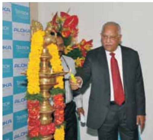
Dr. Pratap C Reddy, Chairman, Apollo Group of Hospitals, lighting the ceremonial lamp.