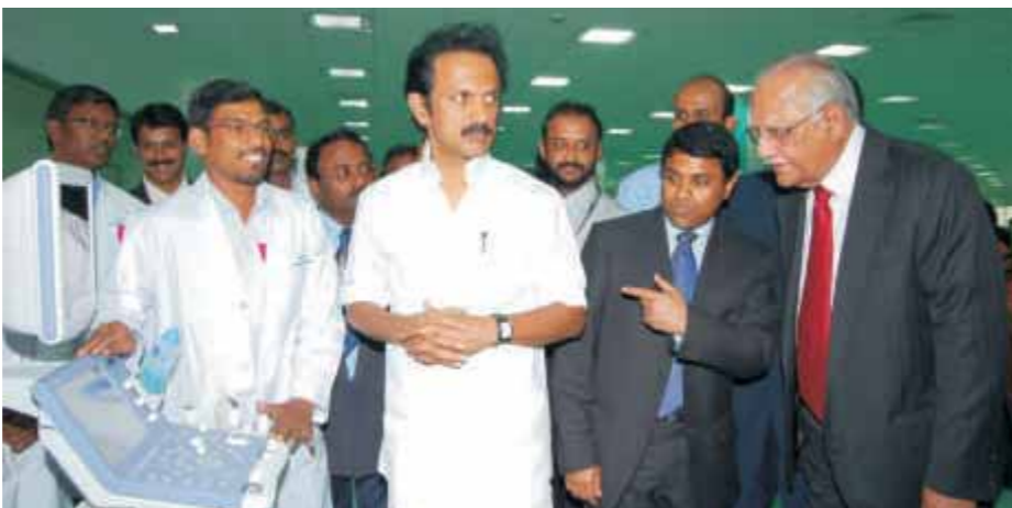
Hon'ble Deputy Chief Minister, M.K. Stalin being given a tour of the facility

The first facility in Trivitron Medical Technology Park, Aloka Trivitron Medical Technologies, was inaugurated on 25th January 2010 by Dr. Pratap C Reddy, Chairman, Apollo Hospitals Group.