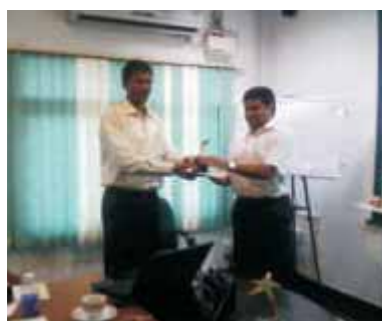
Best Performing Zone East Zone