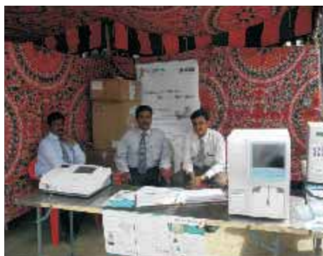
All India Lab Technicians Meet