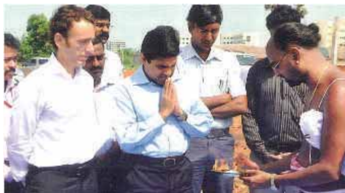
The Bhoomi Puja to mark the laying of the foundation stone of the manufacturing facility of Bio systems Trivitron Diagnostics Pvt Ltd. at the Trivitron Medical Technology Park, at Irungattukottai on 19th September 2009.

with the help of a specialist technical expert from Spain. This facility will cater to both domestic as well as foreign markets. Products are expected to roll out by the end of 2010.