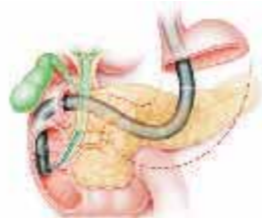
Illustration of a cholangioscopy using SpyGlass(R) System and SpyBite(R) Biopsy Forceps.

SPYGLASS (Endo devices)- Triviron's endoscopy devices division has launched the much awaited Spyglass. The Spyglass Direct Visualization System is the latest advancement in intraductal visualization during a cholangioscopy. The Spyglass system is the first single operator, intraductal system that allows for not only optical viewing, but also optically-guided biopsies and has been shown to be compatible with electro hydraulic lithotripsy (EHL) and holmium laser to fragment stones.* The SpyGlass System is designed to allow the physician the ability to directly see the site of interest, whether it be a stricture, stones or other area of concern, vs. traditional visualization techniques such as x-ray.