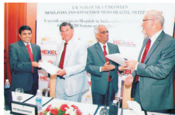
Launch of Tie up between Hexel and Sonnenhof Swiss Health, Switzerland

Since its inception, Hexel has successfully offered its services to several ventures – in almost all emergent markets of India, and in the Middle East & China.