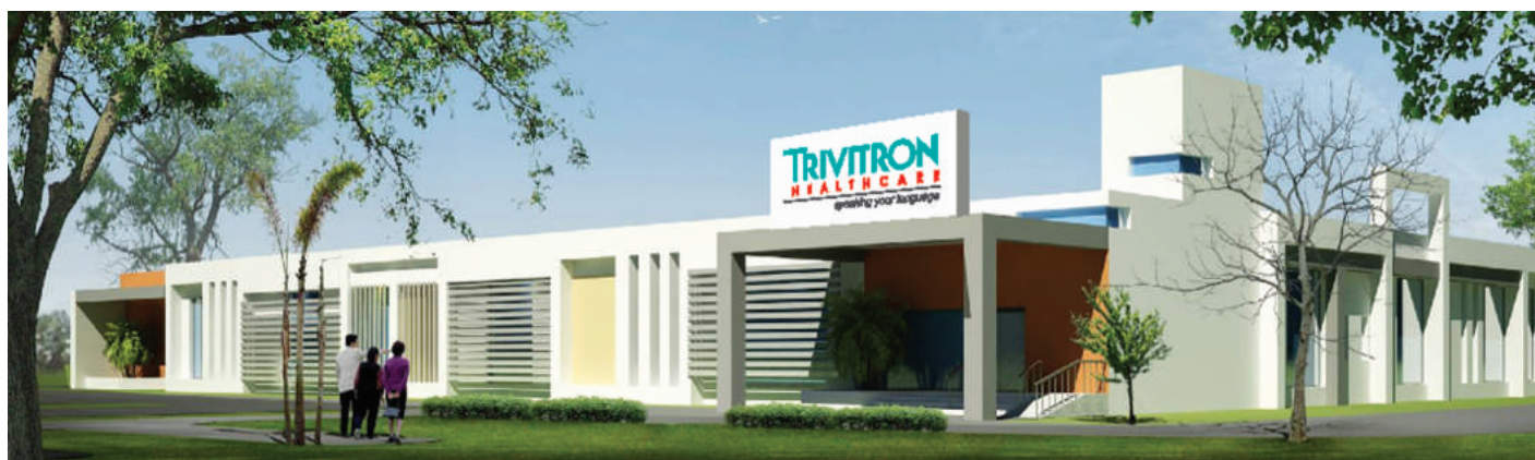
The Trivitron Medical Technology Park at Sriperumpudur - the first Indian manufacturing initiative for indigenous medical technology products.

Trivitron Healthcare has also invested in joint venture manufacturing with Vision Medicad, Pune for the manufacture of high-end x-rays.