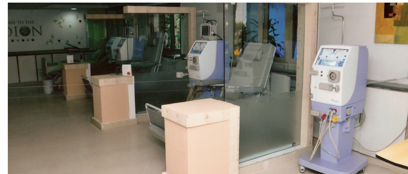
Apollo Dialysis Cliniques.

For the first time in India's medical history, dialysis patients are going to experience renal care designed with them in mind. That is our understanding of quality and that, we believe, will make all the difference.